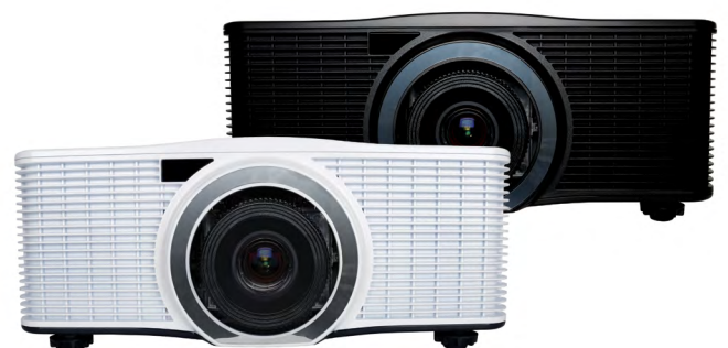
ZU650 laser-phosphor projectors

Bounce has patented the Wonderball tech which combines ball tracking technology and the latest in interactive projection mapping.